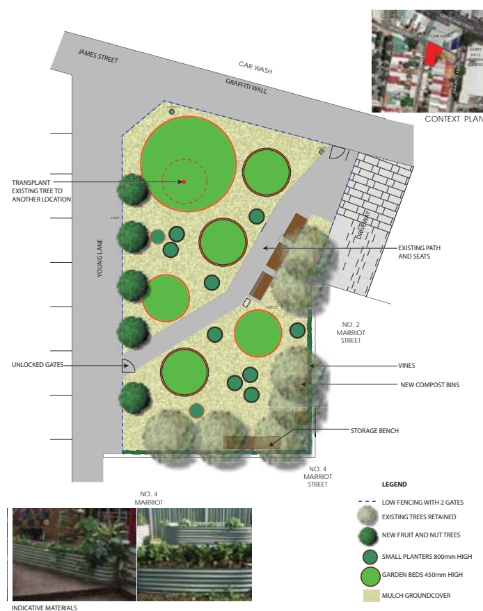
James St Community Garden concept design