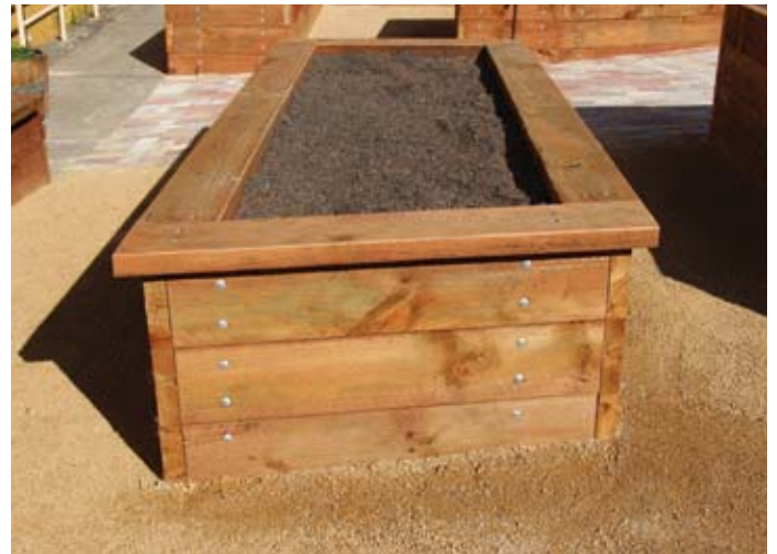
St Helens Community Garden – garden beds 450mm or higher.

http://www.cityofsydney.nsw.gov.au/_data/assets/pdf_file/0007/206791/7848_Community-Composting-guidelines_DE4.pdf