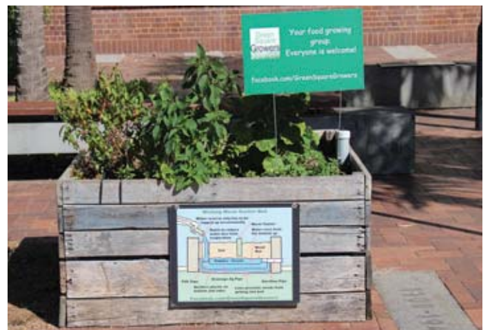
Green Growers Garden Zetlands is an example of a shared garden planter box.