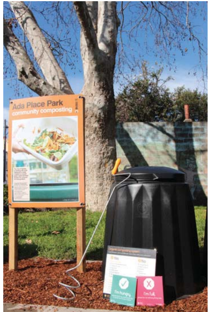
Ada Place community composting – example of signs.