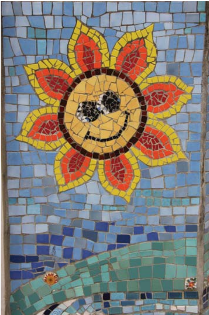
Waterloo Estate community garden – mosaic art.