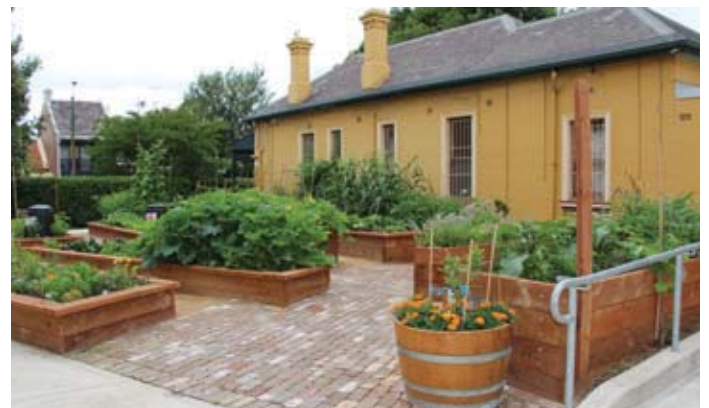
St Helens community garden – after establishing a community garden.