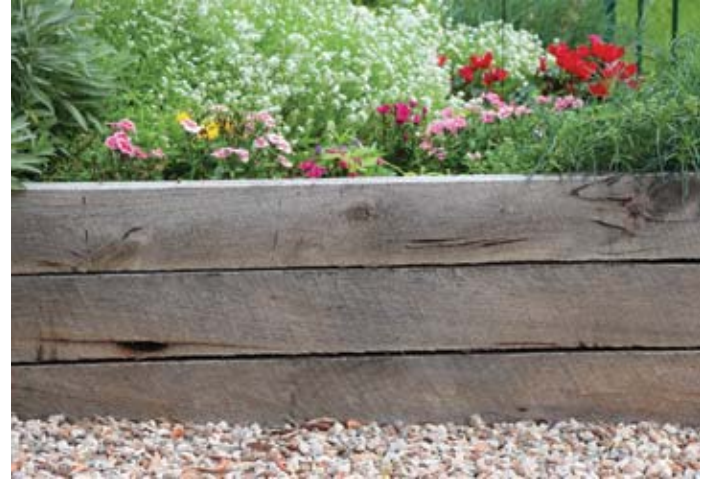
Joanna O'Dea Community Garden is an example of a garden with allotments and some shared areas.