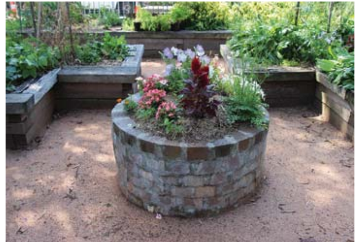
Newtown Community Garden is an example of allotment gardens.