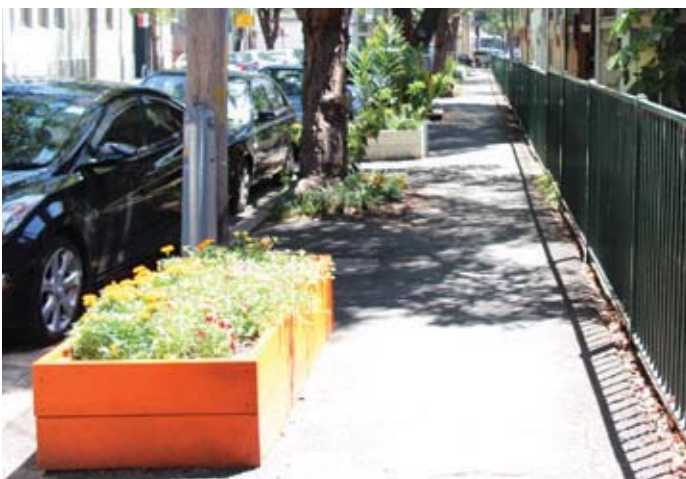
Sustainable Chippendale footpath is an example of a footpath verge garden.