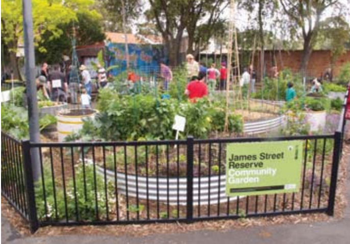
James St Reserve Community Garden is an example of a communal garden where the entire garden is managed collectively.