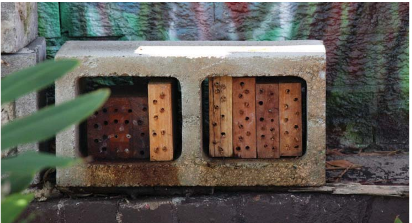
James St Reserve community garden – native bee habitat hotels.

The keeping of fowl must not cause any nuisance to neighbouring premises such as noise, waste that could attract vermin, odour, or other issues that could deem the land or premises to be unhealthy. The City can serve legal orders and notices for these matters under the Local Government Act 1993 .