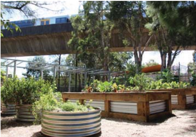
Bourke St Community Garden is an example of combined communal and allotment gardens.