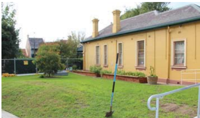
St Helens community garden – before establishing a community garden.

The City will prioritise support for new gardens in areas that do not have a community garden within a short walk of a major residential area. This includes suburbs such as Surry Hills, Kings Cross, Green Square, Beaconsfield and Roseberry.